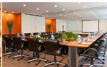
Executive Meeting Room