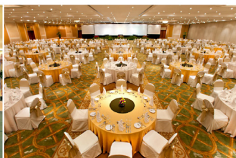
Napalai Convention Hall