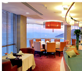
The Peak Chinese Restaurant